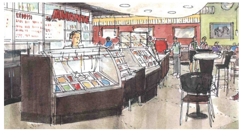
The artist's conception of the Amante coffee shop (above) and photos of the actual location (top and below) are virtually identical - to the delight of the owners. The stained concrete floor is stylish, durable and easy to clean.

If you haven't been to Amante, go on in, have a latte, and be inspired. Who knows what dreams await you? And if those dreams involve construction or remodeling, be sure to stop in to Melton Construction on your way back and talk with Ty. He'll turn your dreams into reality.