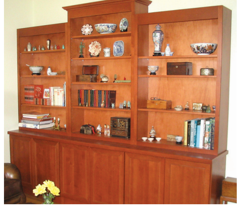
The Gaddy's display/storage unit is in fact 7 pieces, mounted together and fastened to the wall behind. They are very sturdy, yet can be dismantled and reassembled in a variety of configurations.

An example of Melton's work can also be found in the library of the Koenig Alumni Centre. A few years ago, Ty was asked if he could create a wall unit for the library that would resemble the original bookcase that had been replaced in the 1970s. "It's not exactly the same," Ty admits, "because their needs have changed. They wanted an area