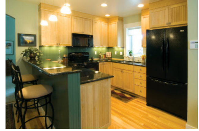
The kitchen work area is small enough to have everything within one or two steps, yet the room has lots of visual space, and an elevated counter with seating, allowing cook and company to visit.