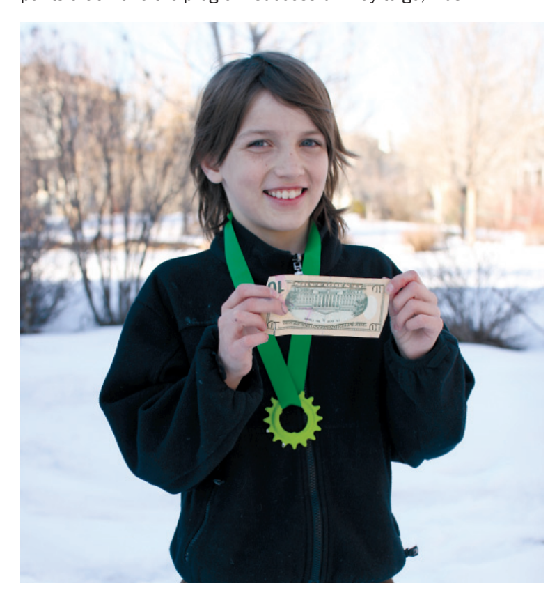
This happy 'Freiker' shows off his Green Gear award and the accompanying cash prize. For more information, or to register, visit www.freiker.org

At Melton Construction we think it's important to support community initiatives that encourage a clean environment and healthy living. We salute the Freiker program and all of the volunteers and participants that make the program successful. Way to go, kids!