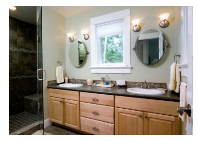
The new master ensuite features a double-depth shower stall and a double vanity with lots of storage space.