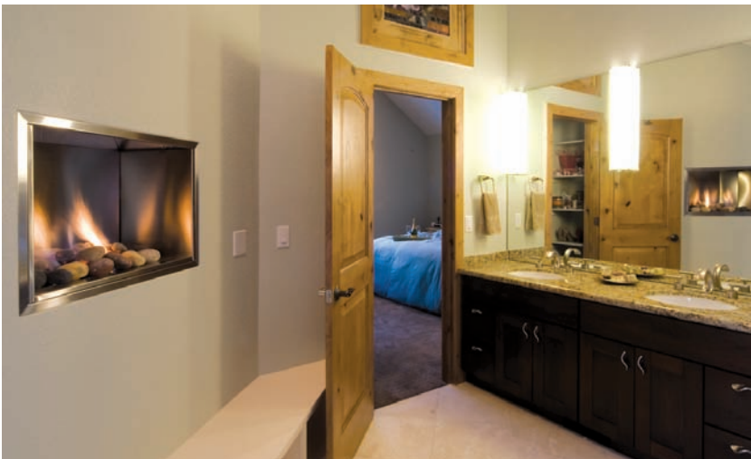
A fireplace in the ensuite bath may be called luxurious to some, and good planning to others!