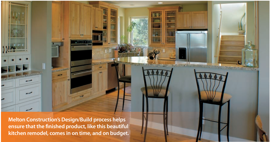
Melton Construction's Design/Build process helps ensure that the finished product, like this beautiful kitchen remodel, comes in on time, and on budget.