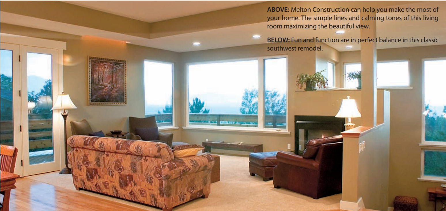
ABOVE: Melton Construction can help you make the most of your home. The simple lines and calming tones of this living room maximizing the beautiful view.