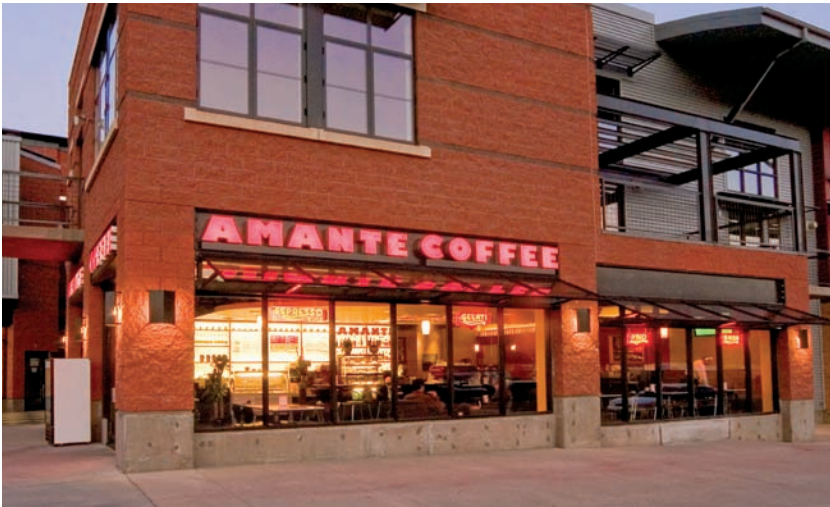
Many familiar Boulder landmarks, like Amante Coffee, are the product of Melton Construction's skilled craftsmen.